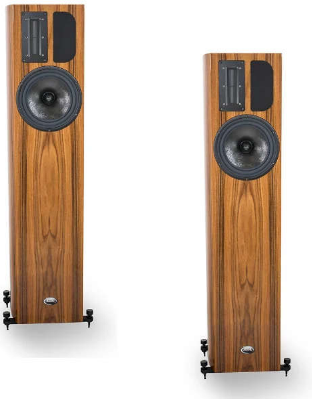
The Musical Garden of Eden

Hz to 30 kHz - 3dB Cut-off frequency: 2.8 kHz